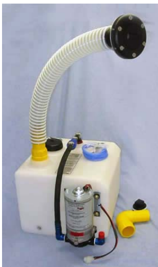
A straight and 90 degree oil tank fitting (yellow) is provided so you can custom fit the fill fitting