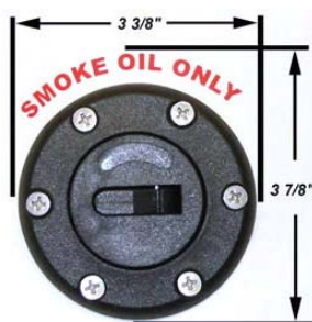
View of fill fitting mountd on fuselage

The cap is attached to the fill fitting by a chain and has a retracting lever for scrweing it on and off.