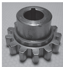
Replacement Drive Gear

E-Mag is a next-generation electronic ignition, designed to serve as an upgrade or replacement for traditional aircraft engine magnetos. The idea behind a next-generation "anything" is that it 1) builds on what came before, and 2) gives more of what the customer wants. EICAD™ expanded controls - E-MAG interactive control and display is an optional set of ignition control capabilities built into our newest series ignitions. • Customize Tach Output Signal • Monitor/Change/Store your preferred timing shift • Ignition status reports (roughly 3 pounds and 6.25" long with plug wires attached). Sealed electronics are impervious to water, dirt, and oil. The P model draws power from the aircraft buss, but is backed up by a built-in three phase brushless alternator. Forget about batteries or keeping a magneto for back-up. Includes a lockout feature that guarantees the ignition will not fire before TDC during start-up. Were this to occur, an expensive starter motor can be damaged or destroyed. Designed to endure significant voltage dips. Should take about two to three hours to install. Will let you set timing for one or both ignitions in about 60 seconds - without the need for any special tools. Detects whether it's installed on a right or left rotating engine, and adjusts automatically. Reuse your existing keyed (or other) kill switch to control E-MAG operation.