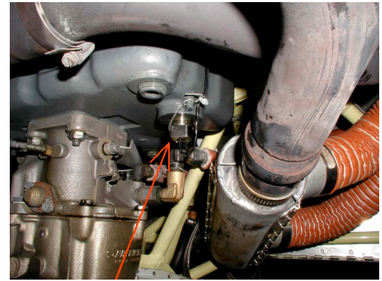
Sensor shown installed in a Lycoming O360-A1A