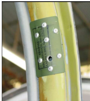
Right Upper Attachment PN 4.2002

The installation of the doubler is accomplished through the addition of seven (7) nominal Cherry Max rivets interspersed amount the eight (8) existing flush rivets