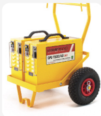
GPU 1500/40 Twin