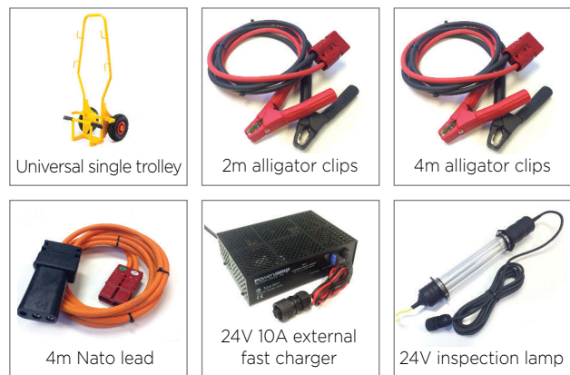
Universal single trolley