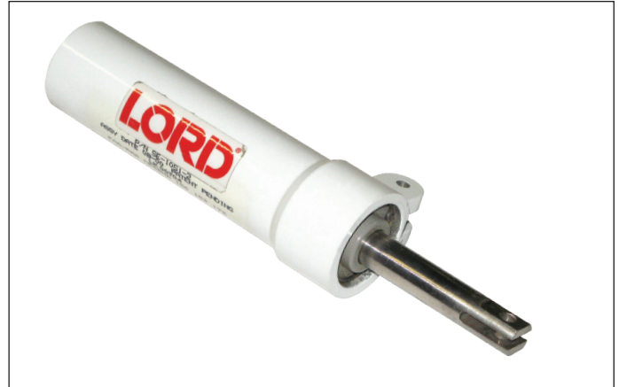
LORD Shimmy Damper

Versatile – Consistent damping from -30° to 150°F.