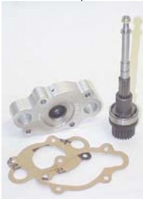
Figure #9 – This aftermarket kit uses a longer shaft plus an extension block to add an extra pair of seals. To change these seals all you have to do is remove the block.

Aftermarket Solutions: Failures of the RV area are common enough for an aftermarket solution to appear. The designer here has come up with an elaborate set up that includes a completely different longer shaft that allows the regular block seals to remain in place and adds an extra pair of seals in a special extension housing. In order for this system to leak you need to loose no less than four seals before a fluid exchange takes place. The other advantage is that to change the outer seals all you need to do is remove the block. The shaft stays put unless it has been grooved. Not a bad fix but with all the new parts you need the conversion is on the expensive side. See Figure #9 for most of the new parts needed for this conversion.