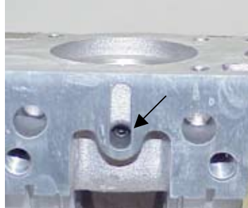
Figure #1 – A setscrew plugs the cast passage in the upper case half that leads to the area between the two shaft seals. See arrow for setscrew.

Production Variations: In an effort to solve the shorten life span on these parts the factory made a number of changes. First, way back in the 532 series engines, the shaft diameter was reduced from 12mm to 10mm to reduce the speed on the shaft and seal. This required the shaft and the seal to be changed. 10 years and factory replacement parts makes running into this 12mm set-up extremely rare. The major changes can when the weep hole or witness passage was plugged off. A passage cast into the crank allows for the vented of the gap between the two facing seals directly behind the water pump impeller. Once either of the seals failed a fluid drip would signify which seal had failed. Unfortunately some operators would mistake this for a water pump housing gasket or crankcase leak and start torquing the water pump bolts or replacing the gasket. This of course did nothing to stop the leak and often times resulted in stripped threads in the crankcase. The photo in Figure #1 shows the passage with a setscrew plug. You can do this yourself with the right size set screw and a little tap and thread savvy. See figure #1