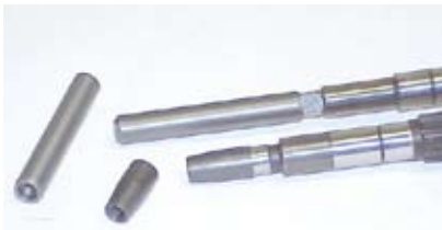
Figure #5 – Rotax makes some inexpensive tools for easy shaft removal and insertion. Both thread onto the end of the shaft.