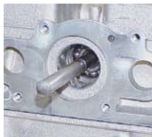
Figure #3 – Removing the RV Shaft can be done with the engine still in the aircraft in most cases. Rotax Tool #876-612 threads nicely onto end of the shaft.

The setscrew plug also made it necessary for both seals to fail before there could be an exchange of fluids. But the cavity must be filled with a lithium or silicone grease to prevent thermal expansion. I have personally seen the seals be forced out the hole in the freeze plug the first time the newly assembly area came to operating temperature. More about this when we talk about re-assembling the parts.