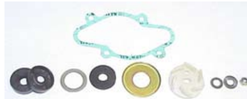
Figure #6 – Several parts after seal pair are now considered optional. The freeze plug and associated parts help prevent seal walk.

There is a progression of parts that are optional after the seals are installed. A shim, rubber disc, and metal freeze plug can be tapped into cavity for extra support to prevent seal walk. See Figure #6 for parts progression. Reinstall water pump impeller and housing.