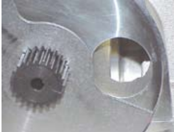
Figure #7 - With the Mag side piston at TDC install the valve plate as shown with the plate right at or just above the bottom of the Mag side port. Flipping the plate over will give a slightly different positioning.

Timing the Rotary Valve Plate: With the Mag side piston at TDC install the valve plate as shown in Figure #7 with the plate right at or just above the bottom of the Mag side port. Flipping the plate over will give a slightly different positioning.