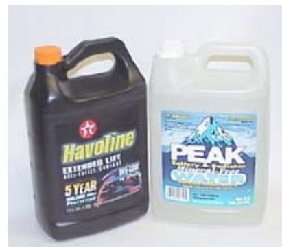
Figure #10 – Havoline Dex-Cool is a patented formula that is silica free. Mix only with mineral free or distilled water to reduce contaminants.

The Trouble with Silica: What's silica? Most antifreeze formulas include a small amount of a substance known as "Silica" or SiO 2 . Webster's Dictionary states "Silica is a white or colorless crystalline compound. Occurring as a quartz, sand, flint, agate, and many other minerals and used to make glass or concrete." In short silica is an abrasive compound. Silica will come out of solution during temperature spikes in the cooling system. Silica will then collect on the RV shaft at the seals and acts as an abrasive to allow the contact to cut the shaft. Ever look at the bottom of your radiator cap and see a gel like substance, this is silica. Or if you pour the fluid out and you find a flake like film, that is also silica. In order to get a silica free coolant you need to look for Havoline Dex-Cool® or extended life coolant. This formula is usually an orange color and needs to be mixed 50/50 with mineral free or distilled water as shown in Figure #10. Some Dex-Cool formulas may be already mix 50/50, so check the label carefully. Wouldn't you know it, the black gallon container shown here makes no mention of the word "silica". According to what I understand Dex-Cool® is a patented formula and a closely guard brand name. These products can be found at most automotive parts stores.