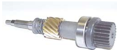
Figure #4 – With the shaft removed inspect the area where the two #17 seals have been operating. Replace if worn or grooved.

Removing the RV Shaft: Surprisingly enough repairing this area can be accomplished in most cases with the engine in the aircraft. You need to remove the water pump housing and impeller as well as the RV cover behind the carburetors. Remove the snap ring #41 in Figure #2. You may also find a metal "freeze plug" #28 guarding the shaft seals. This will have to be destroyed for removal. At this point you can, only with the right tool, hammer the shaft out from the water pump side. See figure #3. Don't ever think about using a hammer on the naked end of the shaft. Part #876-612 is an inexpensive (for Rotax) tool that threads onto the end of the shaft and allows you to hammer the shaft out. The spring #23 may compress in the process.