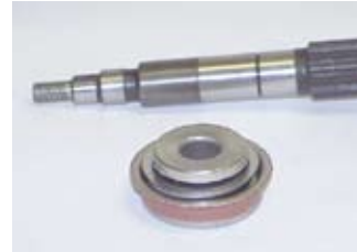
Figure #8 – The new blue head engines have done away with the rubber seals in favor of a new rotary seal and RV shaft. This combination seems to have no problems reaching the 300 hour TBO mark. Order #8777-258 Seal Tool to install delicate ceramic seal.

Rotax 582 Model 99: The new blue head 582 is equipped with a new style ceramic Rotary Seal that takes the place of the old rubber seal pair used on previous engines. This set up uses a completely different RV shaft and is not retrofit able to older engines without extensive machining of the seal passage. See Figure #8.