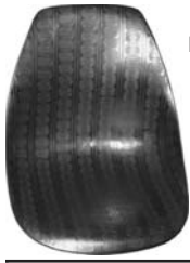
ULTRALIGHT BUCKET SEAT Bucket seat for Ultralight aircraft.