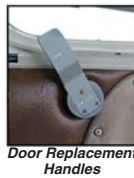
Door Replacement Handles