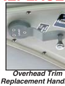
Overhead Trim Replacement Handles

Piper no longer produces the trim handle, and an estimated 10% of 31,000 Pipers on the registry which utilize their handles. The OEM handles are a very weak link in the entire door assembly. Everything downstream of the handle is pretty secure. Therefore, they have improved the handle and are STC'd and PMA'd for certified aircraft.