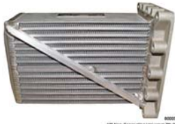
8000545 10" Non-Congealing Universal 7th Stud

Aero-Classic's engine mounted oil coolers for Continental powered aircraft offer high quality features such as a CNC machined base for reliable, leak-proof mounting. Aero's line of Continental front mounted oil coolers feature a hassle free design that accommodates both 7th stud and non-7th stud engine cases - eliminating the chance of getting the "wrong" oil cooler. The oil coolers on Continental engines often mount directly to the engine and do not require hoses. All FAA-PMA approved with supporting FAA 8130-3 documentation, and full two year warranty.