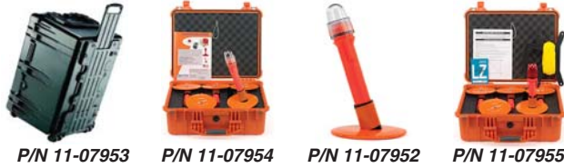
P/N 11-07953 P/N 11-07954 P/N 11-07952 P/N 11-07955

An "airfield in a suitcase" solution. A fast-deployed, 40 light kit of our Landing Strip Light. Used for expeditionary, improvised or temporary airfields. Suitable for a 4,000' runway, if placed at typical 200' intervals (max.). Order multiple kits for longer runways. Operators Liability-The system has been designed to be operated under normal visual meteorological conditions for night flying by a pilot with normal vision. The system is utilized at the operator's discretion and risk. The suppliers accept no liability whatsoever whether implied or explicit for any incidents/accidents that may incur. The operator must ensure that trained personnel operate the system and are made fully aware of aviation safety and that the runway remains clear of animals, pedestrians and obstructions at all times during landings and takeoffs. Only competent and currently night rated pilots may use this system. Use by student pilots training for night rating is prohibited.