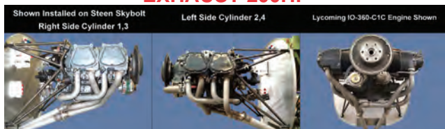
Shown Installed on Steen Skybolt