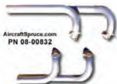
AircraftSpruce.com PN 08-00832