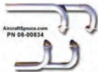
AircraftSpruce.com PN 08-00834

Fits all Lycoming 4 cylinder engines. P/N 08-00834 ..... $1,351.00