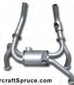
AircraftSpruce.com PN 08-02100

PN 08-02100-Fits Lycoming O-320 (Vertical Induction Intake) (Must use "short" miniature light weight Sky Tec starter for clearance) (Optional studding to increase cabin heat available) PN 08-02102-Fits Lycoming O-360 (Vertical Induction Intake) (Must use "short" miniature light weight Sky Tec starter for clearance) (Optional studding to increase cabin heat available) P/N 08-02100 ..... $2,045.00 P/N 08-02102 ..... $1,967.00