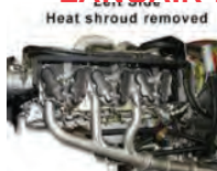
Heat shroud removed

Lancair legacy exhaust system, left & right hand manifolds with tailpipes and cabin heat shroud. Fits IO-550 Continental.