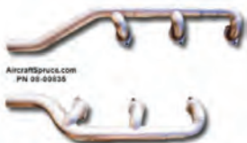
AircraftSpruce.com PN 08-00835

Fits 6 cylinder Berkut only. P/N 08-00835..... $1,525.00