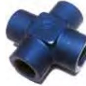
AN918 CROSS INTERNAL PIPE THREAD