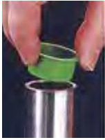
Recommended closure for tube & hydraulic fittings.