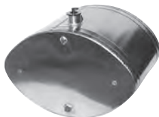
PITTS SPECIAL FUEL TANK