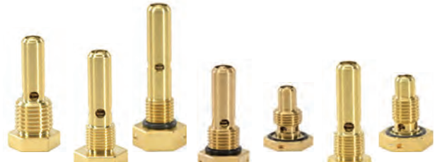
SA14 SA18 SA32 SA72 SA82 SA53S

SAF-AIR designed its line of flush mounted fuel drain valves to be an exact replacement for the Auto Valve F391 line of flush fuel drain valves. Unlike the Auto Valve, SAF AIR valves can be rebuilt. These valves offer a dependable, low-cost solution when a flush mount is needed. FAA & TSO-C76 approved.