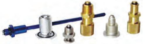
4350-6L F75 P3750 C500 SA-60S SA5817-4C

The F75 is used on wing tip tanks or any application where a 3/4"-16 flush mounted fuel drain valve is needed. This aluminum valve is simple and clean to operate, using any standard sampling tube. Just push up on the center of the valve to sample fuel. Our new design allows all the fuel to enter the tube without leakage. This valve is designed for use on Cessna 310 through 441 model airplanes. • The C500 is used on the bladder style wing tanks with a 1/2" diameter nozzle. • The P3750 has a 3/8" NPT thread and is designed for use on those applications. Both valves provide push-to-test or push-and-twist features for locking the valve open. Material is 360 brass. • The SA5817-4C is used with a 3/4"-16 bulkhead fitting to mount the valve flush with the outside skin of the plane. A hose is attached to the valve with a 7/16"-20 fitting at the low point of the fuel system. Material is anodized aluminum. • The SA-60S valve is the same as the CAV-160 except it is constructed of 304 stainless steel. Valve can be used in highly corrosive applications such as salt water. • 4350-6L has a 7/16"-20 thread and a long stem that can be cut to length for your application. Material is anodized aluminum.