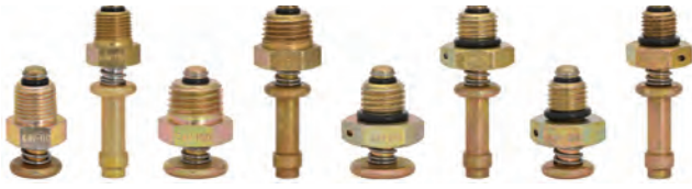
CAV-110H-4 CAV-160H-4 CAV-170H-4 CAV-180H-4 CAV-110 CAV-160 CAV-170 CAV-180

SAF-AIR push type fuel drain valves are close tolerance valves of simple design. These valves provide the most trouble free operation of any other line of valves in the industry. SAF-AIR valves are manufactured with an o-ring placed on the stem to seal against a flat seat on the body. This design eliminates an area where dirt can gather, thus putting an end to the main cause of fuel drain valve drip. FAA & PMA APPROVED.