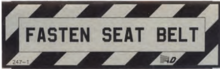
FASTEN SEATBELT PLACARD P/N 05-11642 ..... $5.75