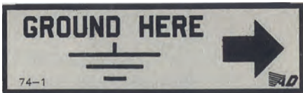
GROUND HERE PLACARD P/N 05-11672 ..... $5.75