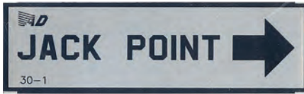
JACK POINT PLACARD P/N 05-11652 ..... $5.75