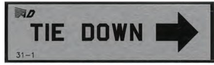
TIE DOWN PLACARD P/N 05-11656 ..... $5.75