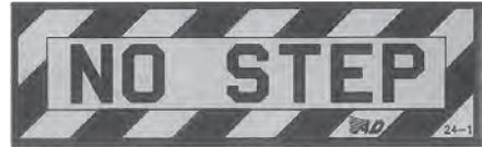
NO STEP PLACARD P/N 05-15360 ..... $5.75