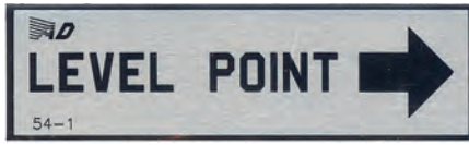
LEVEL POINT PLACARD P/N 05-11670 ..... $5.75