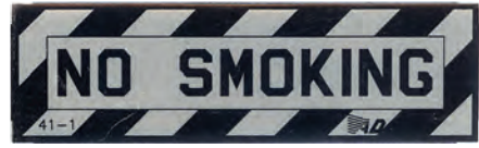
NO SMOKING PLACARD P/N 05-11663 ..... $5.75