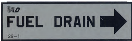
FUEL DRAIN PLACARD P/N 05-11650 ..... $5.75