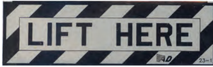
LIFT HERE PLACARD P/N 05-11640 ..... $5.75