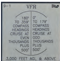
VFR PLACARD P/N 05-15357 ..... $5.75