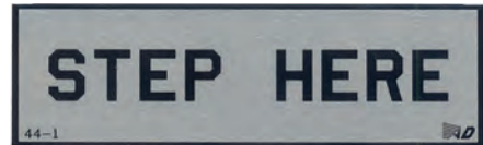
STEP HERE PLACARD P/N 05-11664 ..... $5.75