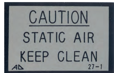
CAUTION STATIC AIR PLACARD P/N 05-11649 ..... $5.75