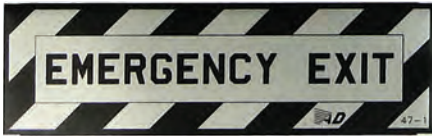
EMERGENCY EXIT PLACARD P/N 05-11668 ..... $5.75

Made of aluminum foil with a pressure sensitive backing which adheres to most any surface that is clean and dry. The facing is made with a special anodize process which will resist sun fade-out and surface abrasion. These are the original placards that went into production in 1969. The placard material and anodize process meets Federal Specifications GG-455B and MIL-P-15024-B. The adhesive meets MIL-P-6906-A. Unless otherwise specified the placards are made of soft aluminum.