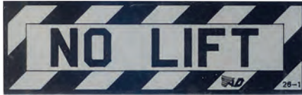
NO LIFT PLACARD P/N 05-11648 ..... $5.75