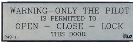
WARNING DOOR PLACARD P/N 05-11644 ..... $5.75