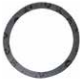
TCM MAGNETO GASKET 649954 P/N 05-11920 ..... $1.20