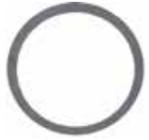
FUEL PUMP GASKET - 649962