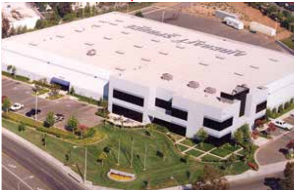
Present Home of Aircraft Spruce West (225 Airport Circle, Corona, CA.)