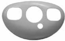
PA 12 & 14