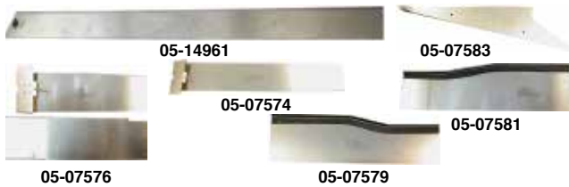
Examples of Fairings are for Reference Only!