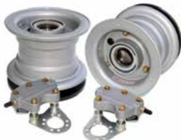
P/N 57-124 Shown