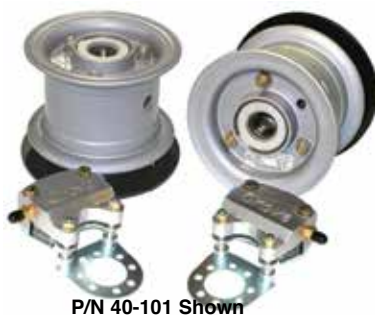
P/N 40-101 Shown

Manufactured from aerospace grade aluminum