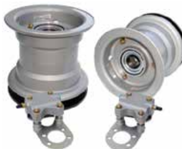
P/N 66-152 Shown