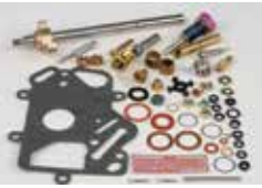
This image is for reference only. Kit contents may differ per kit

Marvel-Schebler "Quick Kits" are easy to use, and are designed to save you time and money. Quick Kits include not only the recommended replacement parts used in every overhaul, but the additional parts used by all fuel professionals to insure the job is done right.