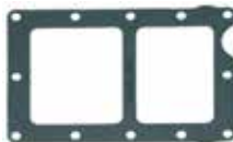
TCM OIL GASKETS TCM 654555 Oil Cooler Gasket for Continental Engines .....P/N 06-02162 .....$21.65