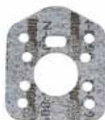
LYCOMING PROP GOVERNOR GASKET Propeller governor gasket for Lycoming O-320 A & E Series engines. ....P/N 72053 .....$1.95