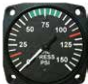
2-1/4 inch UMA Electronic Oil Pressure Gauge Case: Valox 420 Plastic Weight: 4.7 oz.