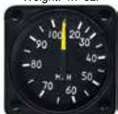
2-1/4 inch UMA Electronic Hydraulic Pressure Gauge Case: Valox 420 Plastic Weight: 4.7 oz.

SENDER NOT INCLUDED SEE NEXT PAGE FOR SENDERS