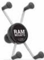
RAM® X-Grip® Large Phone Holder with Ball P/N 11-12987 $34.50