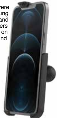
RAM® Form-Fit Cradle for Apple iPhone 12 & 13 Pro Max with Ball P/N 11-19216 $15.99

These high-strength composite, form-fit cradles were designed specifically for the Apple and Samsung devices. Allowing for one-handed docking and removal, all buttons, cameras, ports, and speakers are left exposed. With the two-hole AMPS pattern on the back of each cradle, attach to a RAM® diamond ball base and additional RAM® components.