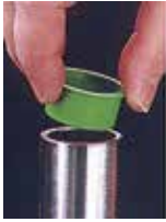
Recommended closure for tube & hydraulic fittings.