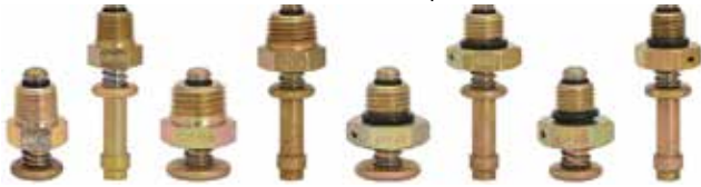
CAV-110H-4 CAV-160H-4 CAV-170H-4 CAV-180H-4 CAV-110 CAV-160 CAV-170 CAV-180

SAF-AIR push type fuel drain valves are close tolerance valves of simple design. These valves provide the most trouble free operation of any other line of valves in the industry. SAF-AIR valves are manufactured with an o-ring placed on the stem to seal against a flat seat on the body. This design eliminates an area where dirt can gather, thus putting an end to the main cause of fuel drain valve drip. FAA & PMA APPROVED.