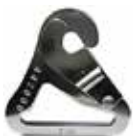
CLIP TYPE END FITTING P/N 442868 (Steel) $39.95 Ea.