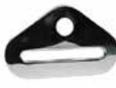
TRIANGULAR END FITTING P/N 13-04101 $27.50 Ea.