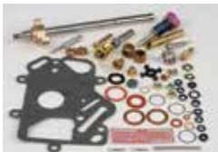
This image is for reference only. Kit contents may differ per kit

Marvel-Schebler "Quick Kits" are easy to use, and are designed to save you time and money. Quick Kits include not only the recommended replacement parts used in every overhaul, but the additional parts used by all fuel professionals to insure the job is done right.