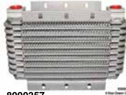
8000357 Bar & Plate

Aero Classics offers the General Aviation community the largest number of FAA-PMA. (Federal Aviation Administration - Parts Manufacturing Authority) approved oil coolers in the world. Remote-mount oil coolers mount to the airframe or engine baffle instead of directly to the engine. Hoses are used to connect the oil cooler to the engine. This type of oil cooler is used with most non-Continental engines including all Lycoming engines. All FAA-PMA approved with supporting FAA 8130-3 documentation unless otherwise noted. All models have 3/8 NPT inlets and outlets. All Aero-Classic coolers come with a full two year warranty. Note: Models 8000081, 8000706 & 8000942 are for experimental aircraft only. Not FAA-PMA Approved. ***May not work with all applications***