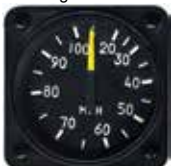
2-1/4 inch UMA Electronic Hydraulic Pressure Gauge Case: Valox 420 Plastic Weight: 4.7 oz.

SENDER NOT INCLUDED SEE NEXT PAGE FOR SENDERS