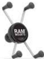
RAM® X-Grip® Large Phone Holder with Ball P/N 11-12987 $35.50