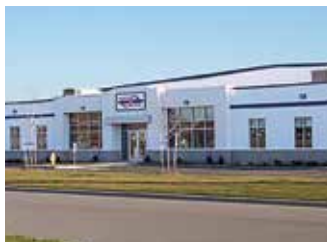
AIRCRAFT SPRUCE CANADA BRANTFORD, ONTARIO