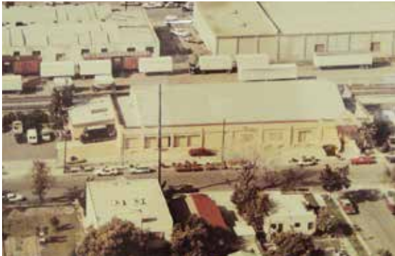
201 West Truslow Ave, Fullerton CA. Home of Aircraft Spruce from 1973 to 1997