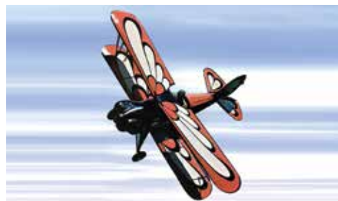
Plans for Baby Great Lakes.....P/N 01-10010 Plans for Super Baby Lakes.....P/N 01-10011 Plans for Buddy Baby Lakes.....P/N 01-10012