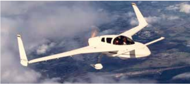
Cozy Mark IV Plans.....P/N 01-00178