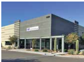
AIRCRAFT SPRUCE SOUTHWEST CHANDLER, ARIZONA