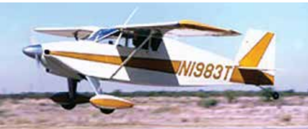
Wittman Tailwind Plans.....P/N 01-10007