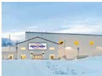
AIRCRAFT SPRUCE ALASKA PALMER, ALASKA