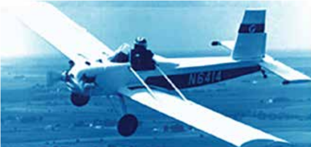
VP-1 Plans and Handbook.....P/N 13-11560