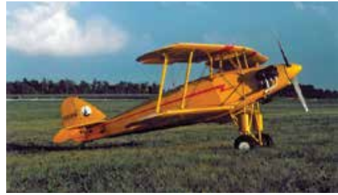
Skyote Plans Kit .....P/N 01-01512