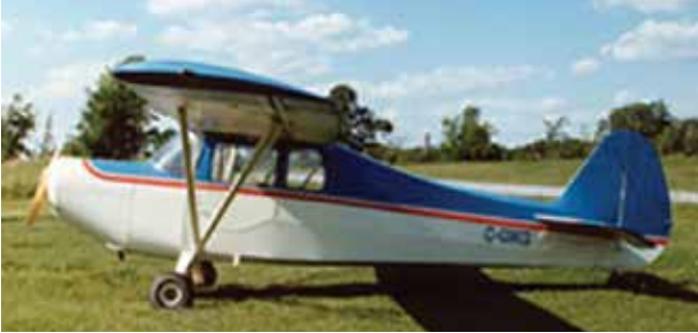
MK-1 Plans.....P/N 01-00663 MK-2 Plans Complete .....P/N 01-00692