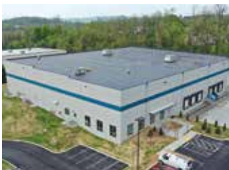
AIRCRAFT SPRUCE NORTHEAST MIDDLETON, PENNSYLVANIA (NEW LOCATION)