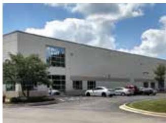
AIRCRAFT SPRUCE MIDWEST WEST CHICAGO, ILLINOIS