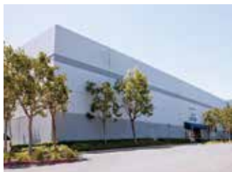
AIRCRAFT SPRUCE WEST CORONA, CALIFORNIA