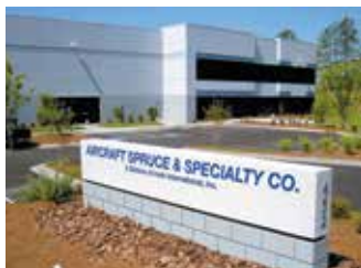
AIRCRAFT SPRUCE EAST PEACHTREE CITY, GEORGIA