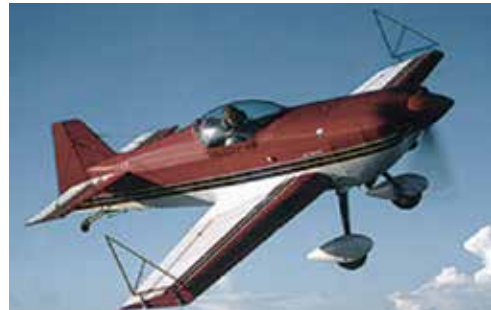
One Design Plans (w/ ID Plate).....P/N 01-06010-C