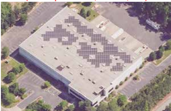
Present Home of Aircraft Spruce East (452 Dividend Drive, Peachtree City, GA)