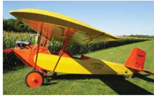
Original Pietenpol Air Camper Plans.....P/N 01-01307