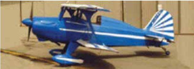
Starduster One SA 100 Plans.....P/N 01-00425 Starduster One SA 300 Plans.....P/N 01-00424 Acroduster Too SA 750 Plans.....P/N 01-00427 Starlet SA 500 Plans.....P/N 01-00428 V-Star SA 900 Plans.....P/N 01-00429