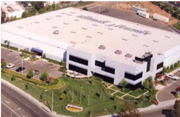
Present Home of Aircraft Spruce West (225 Airport Circle, Corona, CA.)