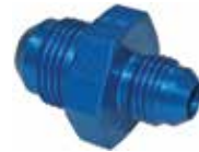
AN919 REDUCER, EXTERNAL THREAD