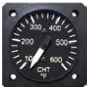
P/N 10-02057 2-1/4", 100-600 °F - 90° sweep for use with thermocouple powered aircraft ... P/N 10-02429 2-1/4", 100-600 °F - 270° sweep for use with internal powered aircraft P/N 10-02057

SENDER NOT INCLUDED SEE NEXT PAGE FOR SENDERS