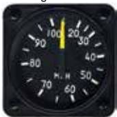
2-1/4 inch UMA Electronic Hydraulic Pressure Gauge Case: Valox 420 Plastic Weight: 4.7 oz.

SENDER NOT INCLUDED SEE NEXT PAGE FOR SENDERS