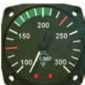
2-1/4 inch UMA Electronic Oil Temperature Gauge Case: Valox 420 Plastic Weight: 4.8 oz.

SENDER NOT INCLUDED SEE NEXT PAGE FOR SENDERS