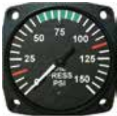
2-1/4 inch UMA Electronic Oil Pressure Gauge Case: Valox 420 Plastic Weight: 4.7 oz.