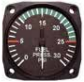
2-1/4 inch UMA Electronic Fuel Pressure Gauge Case: Valox 420 Plastic Weight: 4.7 oz.

Thread sizes: 1/8"-27 NPTF, #10-32 terminals, Common ground through mounting thread, 0-80 psi/0-5 bar range and 240-33.5 Ohms. .... P/N 10-05329