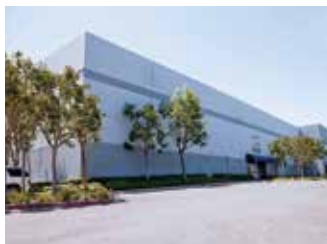
AIRCRAFT SPRUCE WEST CORONA, CALIFORNIA