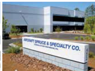
AIRCRAFT SPRUCE EAST PEACHTREE CITY, GEORGIA