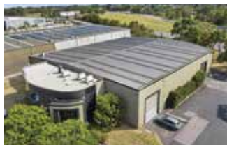
AIRCRAFT SPRUCE AUSTRALIA KEYSBOROUGH, VIC