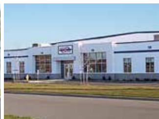
AIRCRAFT SPRUCE CANADA BRANTFORD, ONTARIO