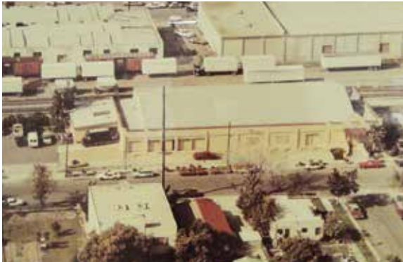
201 West Truslow Ave, Fullerton CA. Home of Aircraft Spruce from 1973 to 1997

Aircraft Spruce was housed in downtown Fullerton, CA. from its founding in 1965 until late 1997. The last 24 years in Fullerton the company was operated in a historic Fullerton former citrus packing house, which we eventually outgrew. In the fall of 1997, Aircraft Spruce moved to a new, 62,000 square foot facility in Corona, California. In the Spring of 2004, Aircraft Spruce East moved to a new 56,000 Sq. Ft. facility in Peachtree City, GA from its old home in Griffin, GA. Aircraft Spruce Canada was opened in Toronto in December 2006, and moved to a new facility at Brantford Airport in Ontario in late 2008. In late 2012 Aircraft Spruce Canada moved into a new 20,000 square foot facility at Brantford Airport. In September 2018 Aircraft Spruce Alaska opened in Wasilla. In 2019 Aircraft Spruce Midwest opened in a 55,000 sq. ft. distribution facility in West Chicago, IL. Regional warehouses are also located in Middletown, PA, Roanoke, TX, Chandler, AZ, and Melbourne, Australia. We are proud of the tradition of our company that now dates back some 60 years, and are pleased to have had the opportunity to help aviators around the world build the plane of their dreams. Our growth, from a single room in 1965 to over 300,000 square feet in ten facilities that we have today, has been a direct result of the loyalty and patronage of our customers. Our goal is to continue to provide the very best in products, prices, and customer service to our friends in the years to come.