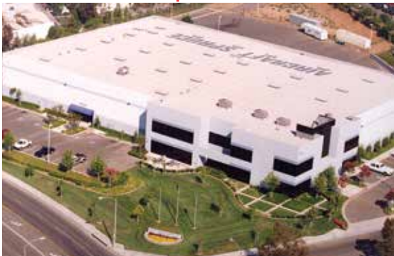
Present Home of Aircraft Spruce West (225 Airport Circle, Corona, CA.)